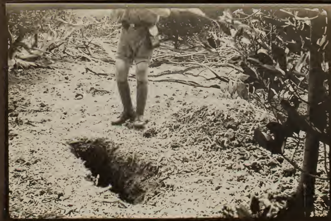
Crab Hole in lagoon swamp